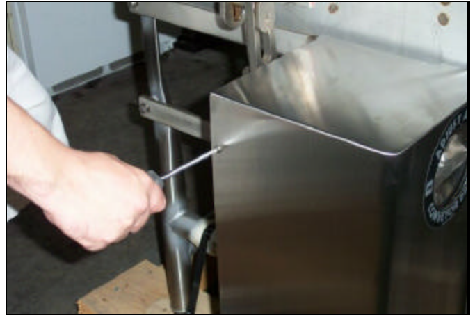
Removing the screws from the top cover.

1. Remove the (2) screws that secure the top drive assembly cover in place.